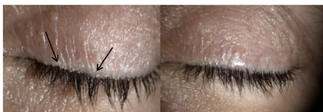
Figure 2. A Demodex -positive patient with Cylindrical dandruff (arrow) before and 2 months after ivermectin treatment