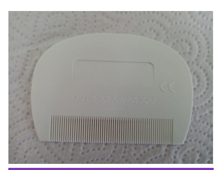
Figure 3. Plastic comb for head lice detection

gender and villages, respectively. According to chi-square analysis, there was a significant difference between the infestation rate of the gender and the villages except for 3<sup>th</sup> and 4<sup>th</sup> combing results (p<0.01). In Çukur district the prevalence was 24.82%. In the second combing, the prevalence of pediculosis decreased in both female and male 0.5% and 6.45%, respectively. The prevalence value increased in the third combing from 0.49 to 2.45 in male students, while no additional infested individuals were found in in Etekli village during the third examination. The lowest prevalence was observed in the last combing. Only 7 out of 407 students in three village schools were positive for pediculosis.