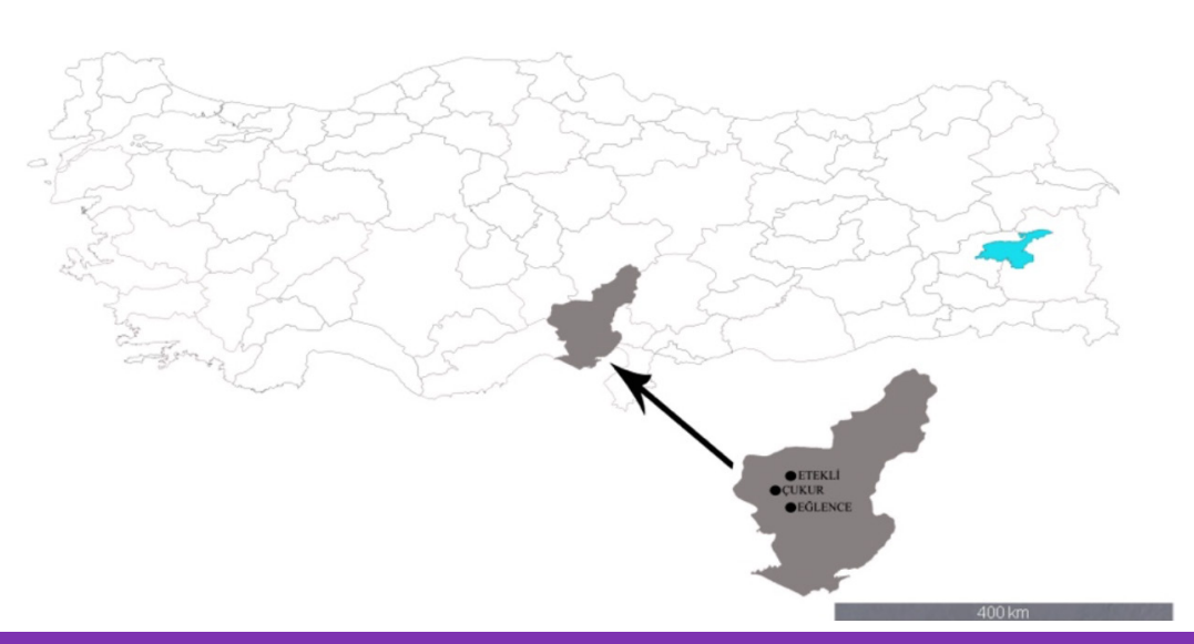
Figure 1. Study areas

In particular, the correct answers given by the high school and university graduate parents after the course were found to be 16.15 and 15.5 on average, respectively. In addition, it was determined that the number of correct answers given by the male parents to the questionnaire after the course was higher than that of the females. It was determined that female teachers gave more correct answers to the pre- and post-course questionnaires than male teachers.