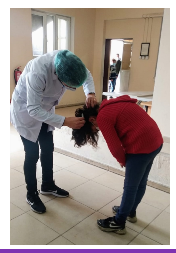
Figure 2. Head combing of students for detection pediculosis

The highest in the first combing to detect head lice was in the school in the Etekli neighborhood with 98.02%. During the first combing, 22.3% of the female pupils were found to be positive for pediculosis. Tables 4 and 5 show the pediculosis prevalence by