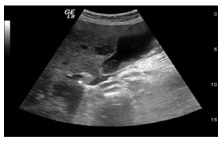
Figure 1. Bile duct wall thickening, and a mobile vermiform structure without acoustic shadowing in the gallbladder

The abdominal ultrasonography (USG) performed for abdominal pain demonstrated a normal common bile duct with no gallstones or sludge; however, numerous hypoechoic heterogeneous lesions in the liver parenchyma compatible with liver abscess were present. With these findings, the patient was considered as having sepsis due to liver abscess; after obtaining blood cultures, we empirically initiated imipenem (500 mg four times a day). Despite treatment, the fever persisted with negative blood cultures. Since the general condition of the patient was deteriorating and the levels of ALT and AST were increasing, we performed a follow-up abdominal USG, which revealed multiple hypoechoic heterogeneous lesions, bile duct wall thickening, and a mobile vermiform structure without acoustic shadowing in the gallbladder. This appearance was supposed to be compatible with fasciolosis (Figure 1). Abdominal magnetic resonance imaging (MRI) also demonstrated hyperintense areas on T2-weighted images and hypointense areas on T1-weighted images in the liver parenchyma without dilatation of the intrahepatic or extrahepatic bile ducts (Figure 2). Based on these findings, the patient was re-questioned in detail; she then gave a history of watercress consumption 3 months before. We performed serological tests and stool examination for Fasciola hepatica.